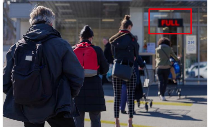
Unmanned automatic store occupancy with a clear sign for when store is at capacity.