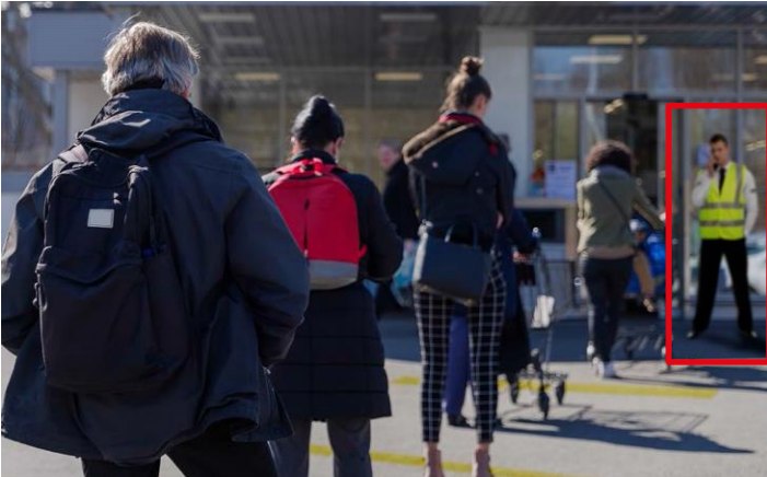
Manned guarding is costly and requires shift work to give cover over opening hours.